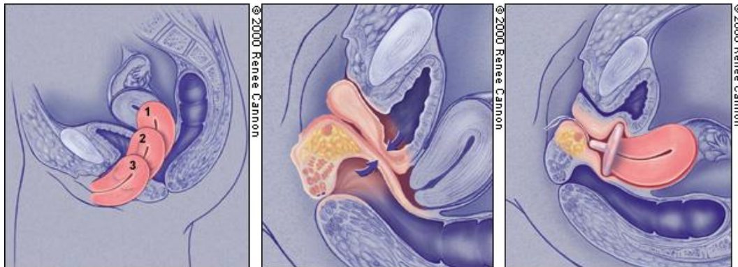
Stages of prolapsed uterus

A pessary may also help women with stress urinary incontinence (the leaking of urine when you cough, strain or exercise). Pregnant women with incontinence can also use a pessary.